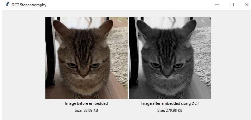
Figure 4. Original Image (Left) and Stego Image (Right)

The embedding process is applied to the grayscale image. Figure 4 shows the original image next to the modified stego image after the secret message embedding.