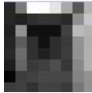
Figure 1. RGB Image Image 2. Grayscale Image Initial Pixel Block (8x8)