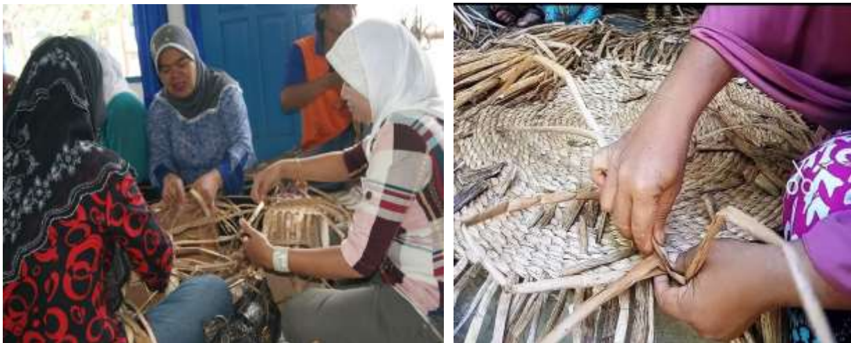
Figure 2. Weaving activities make finished products

A community service activity entitled the use of water hyacinth plants as a weaving business opportunity in 1 Ilir Village, Ilir Timur II District, Palembang City, South Sumatra Province on Monday 25 September 2023. This service activity was attended by housewives who were members of the group PKK. In this activity, an explanation was given about how to make water hyacinth fiber into various products. Processing water hyacinth requires quite a long time, around 25 days for flattening or drying. Then create the pattern you want or according to your request.