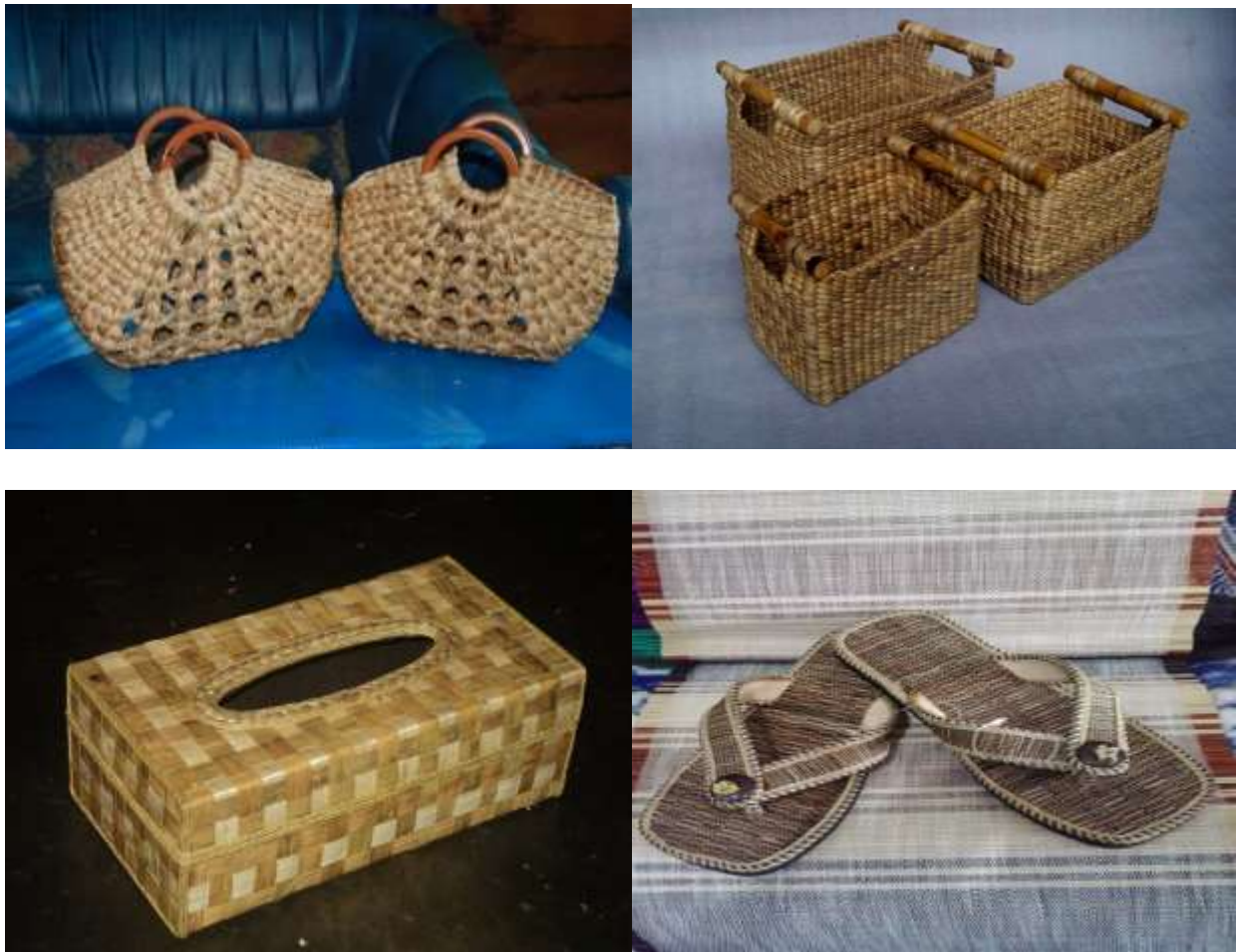
Figure 3. Craft results of water hyacinth chicken products

In this activity, it is easier to obtain materials because of the abundance of water hyacinth plants in Kampung Air, Kelurahan 1 Ilir. To reduce the population of water hyacinth plants which can damage river ecosystems, it is a question of how water hyacinth itself can be utilized and managed into a craft that has high selling value and of course a very unique product.