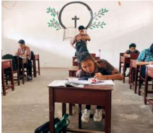
Figure 1. Students are doing the teaching learning process in the classroom