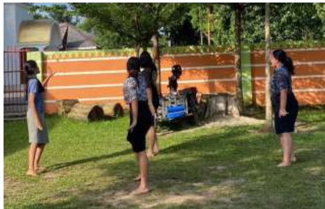
Figure 2. Practices for P5 preparation by the students