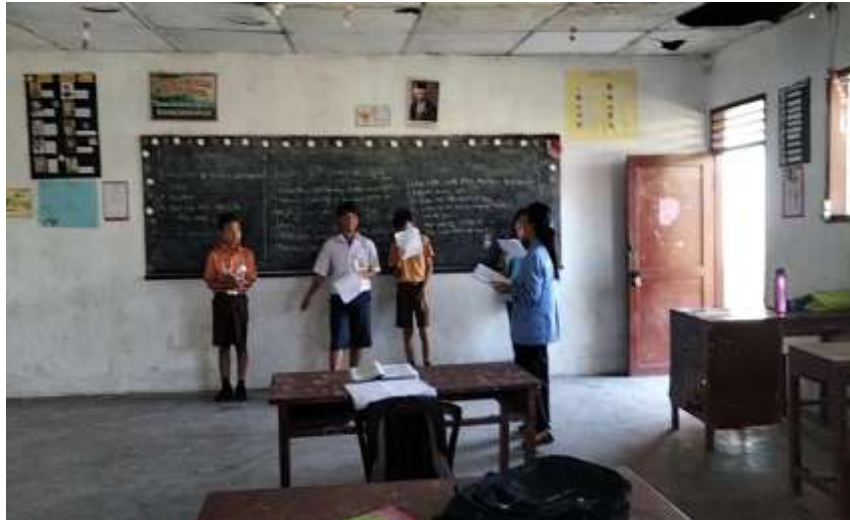
Figure 2. English conversation practice by students in the classroom