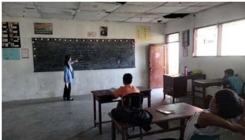
Figure 1. Explanation of English material by the presenter

Discussing the report with the tutor and supervisor to obtain the necessary direction and feedback