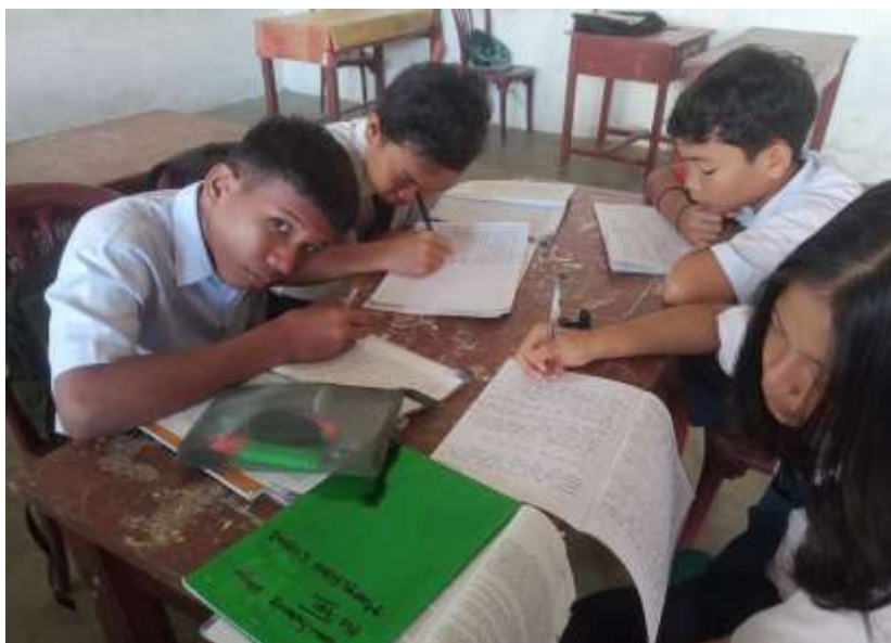
Figure 3. The learning process in group work