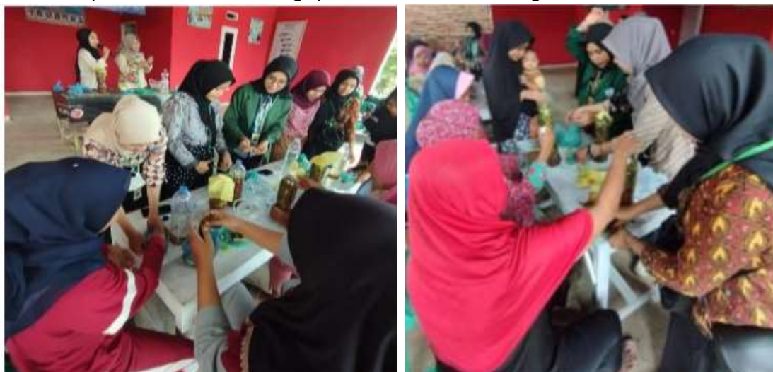
Figure 3. Level of cutting and mixing of ecoenzym ingredients

Therefore, the alternative used is to provide samples of ecoenzyme that have been fermented for 3 months. These samples are distributed by several mothers to be used as an experiment regarding the benefits of ecoenzyme in the household sector such as washing dishes, washing fruit, replacing floor coverings and so on. Based on the results of the activities in this second stage, it is known that the women of the Citerep Hamlet Community have been able to make ecoenzyme liquid with the guidance of the Team. This training activity is a fun activity for the mothers who have attended and is also a new innovation in utilizing household organic waste, so that it can reduce the disposal of household organic waste around the Citerep Hamlet environment, especially at rubbish dumps in oil palm plantations. At this stage the women of the Citerep Hamlet Community were also very enthusiastic in asking questions and discussing.