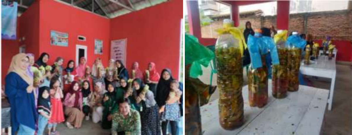
Figure 4. Process of mixing ingredients and fermentation

This mixing is done to ferment all the existing ingredients, so that later the remaining vegetable and fruit waste will be at the top, and the liquid water at the bottom. It is necessary to control whether there is fungal activity or not. The lid of the container can be opened on the 7th day, month and 3 months. For storage, it's best not to be exposed to direct sunlight, and keep away from chemicals, trash cans, rubbish incinerator, and Wi-Fi. Ecoenzymes have various applications in everyday life. Daily use is used to purify water because it has the ability to reduce impurities in water. In addition, eco-enzymes can function as hand sanitizers and disinfectants because of their bactericidal properties so they can kill microorganisms.(Puspita et al., 2021),and contains acetic acid ( \text{CH}_3\text{COOH} ) which can kill microbes(Mahdia et al., 2020). Ecoenzymes can be a low-cost alternative solution for purifying wastewater(Joseph et al., 2021). Ecoenzymes can also be used to decontaminate dirt on clothes through lipase and protease enzymes which are able to hydrolyze oil and protein.(Gu et al., 2021).