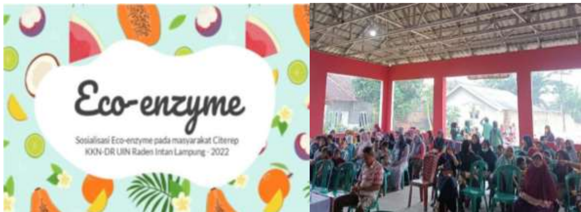
Figure 2. First Stage Activities, socialization and provision of materials.

The next stage, the team carried out outreach activities to broaden residents' understanding by providing ecoenzyme material as well as explaining what tools and materials are used, as well as explaining what ecoenzyme is and some of the benefits of ecoenzyme. As has been explained, ecoenzyme is a multifunctional liquid which has a multitude of benefits, including in agriculture, households and can even be used as medicine. Ecoenzyme is a solution of complex organic substances produced from the fermentation process of organic residues, sugar and water. This Ecoenzym liquid is dark brown in color and has a strong sour/fresh aroma. The tools and materials used in making ecoenzyme are 1.5 L bottles, water, organic waste which includes vegetable and fruit waste, and molasses or brown sugar. In the process of making ecoenzyme there is a ratio of the ingredients used, the ratio is 10:3:1, this ratio is equivalent to 900g of water: 270g of organic waste: 90g of molasses/brown sugar. The higher the organic acid content, the lower the pH value. Ecoenzyme fluid has a high acid content, high Total Solid (TS), high Total Soluble Solid (TST), citric acid and also contains biocatalytic enzyme activity, namely protease, amylase and lipase(Rasit, Lim, & Azxlina, 2019).