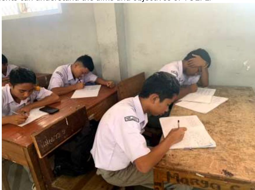
Figure 4. Students write the important things about the material of TOEFL that the presenter gave.

In the 3 rd Figure the presenter introduces students to the types of TOEFL and explains a series of what TOEFL is, such as the meaning of TOEFL, the function of TOEFL. So that students can understand the aims and objectives of TOEFL.