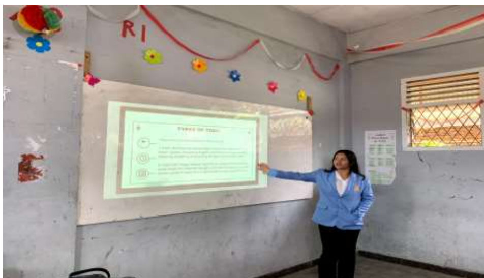
Figure 3. The presenter gave an explanation about TOEFL to the audience

In the 3 rd Figure the presenter introduces students to the types of TOEFL and explains a series of what TOEFL is, such as the meaning of TOEFL, the function of TOEFL. So that students can understand the aims and objectives of TOEFL.