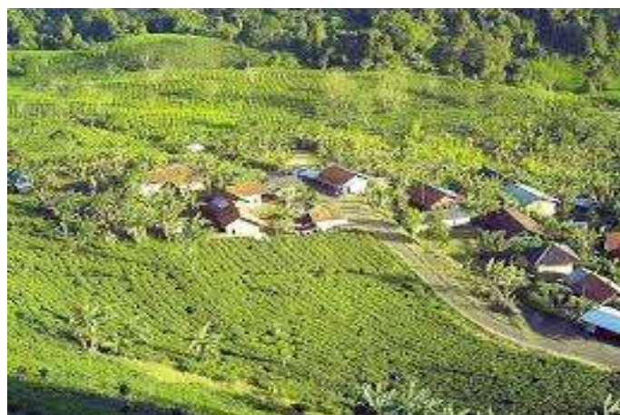
Figure 1 Cisoka Village is located in the middle plantation tea

Cisoka Village , which is located in Citengah Village , District South Sumedang , Regency Sumedang , save various potency stunning tourism and yet fully utilized . Beauty nature , tradition rich culture , and location strategic make it ideal place for development tourist . However , for realize potency is required source Power reliable and capable tourism human resources (HR) . manage destination tour with professionalism and efficiency tall . Local communities , as one of the main stakeholders , need involved in a way more Serious in management destination tourism in Cisoka Village . Participation active they No only increase quality service tour but also make sure that benefit economic and social from tourist can felt in a way directly by residents local .